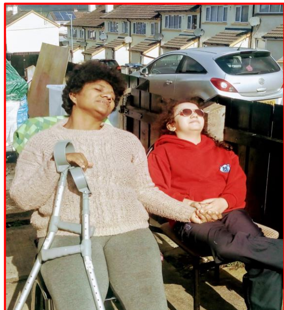
FIRST MEETING OF THE AFTER AFTER-SCHOOL CLUB 😊

What I miss about school is Afterschool Club, friendships, the different A.R books in the Library and other things that I can't really remember, or I can't really explain. What I like about school is that you can have rewards like Pupil of the Week and Pupil of the Month , but mostly to me it's the friendships you have with each other. What I like about Home School are the trampoline jumps (which I think count as school because I learned how to handstand) and doing Coding classes. I love school and Home School equally and I think both of them are great experiences for learning. I also think it's good that kids can still be active and still be learning in such tough times and the fact that this