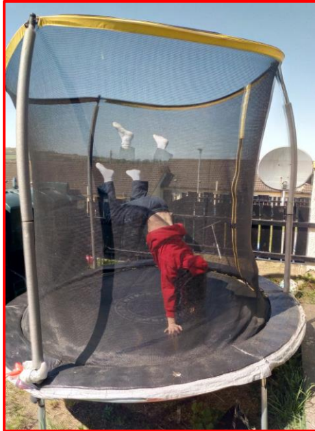
PERFORMING AN AMAZING 4 FEET HANDSTAND!

I got 4 certificates on Minecraft code.org, and if I do well in class with my Dad then I get Cadbury's giant dark chocolate buttons, which are delicious. But the best reward is when I get to chat with my cousins and friends on Skype and play online video games with them after school.